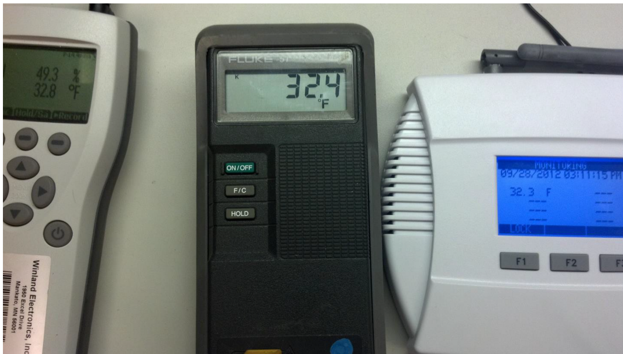
Ice bath losing equilibrium while Vaisala is still lagging